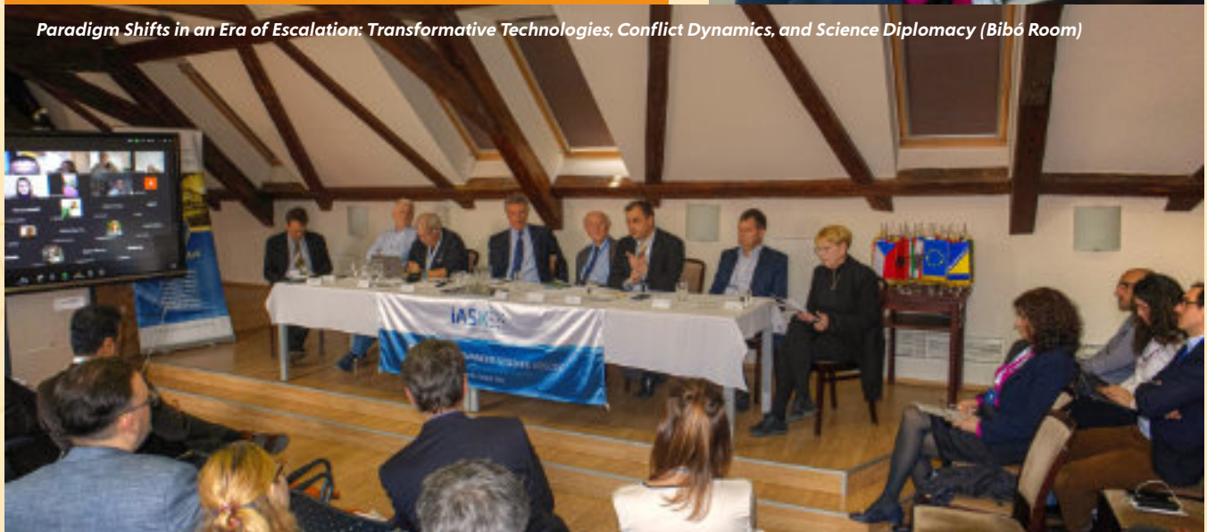
Paradigm Shifts in an Era of Escalation: Transformative Technologies, Conflict Dynamics, and Science Diplomacy (Bibó Room)