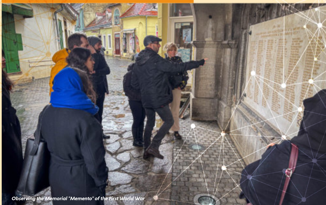
Observing the Memorial "Memento" of the First World War

iASK INSTITUTE OF ADVANCED STUDIES KŐSZEG